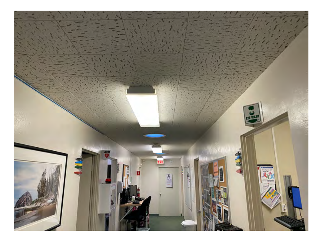
Photo 12- White Plaster Walls, White Wood Door & Casing- 2515 Main St.-CHC Area- Lead-Containing Paint & LBP (Good Condition)

Photo 11- White/ Yellow Plaster Wall- 2515 Main St.-CHC Area- Lead-Containing Paint (Good Condition)