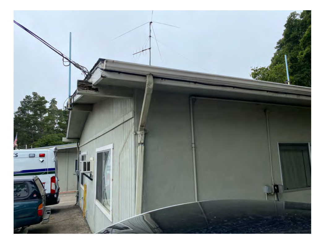
Photo 14- White Wood Door Casing- 2535 Main St.- Exterior-Lead-Containing Paint (Good Condition)

Photo 13- Gray Wood Beam & White Wood Fascia & Window-Mounted Air Conditioner 2535 Main St.- Exterior- Lead-Containing Paint & Refrigerant (Good- Poor Condition)