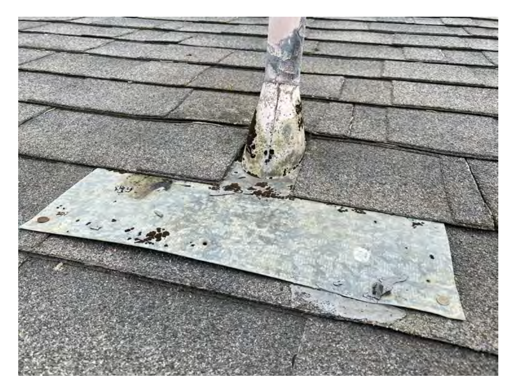
Photo 7- Roofing Mastic- 2535 Main St.- Penetrations Throughout Roof- ACM

Photo 8- Gray Wood Window Casing/ Sill & Gray Wood Siding- 2515 Main St.-Exterior- LBP & Lead-Containing Paint(Poor Condition)