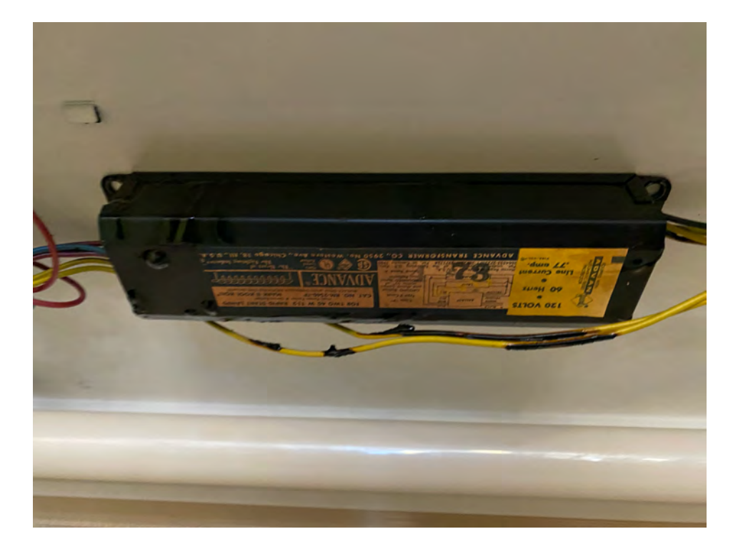
Photo 16- Mercury-Containing Light Tubes in Light Fixtures-2515 & 2535 Main St.- Throughout Area