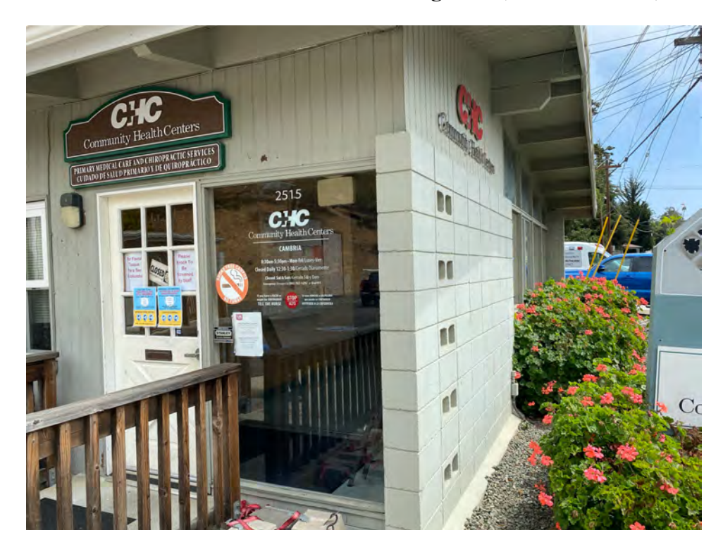
Photo 8- Gray Wood Window Casing/ Sill & Gray Wood Siding- 2515 Main St.-Exterior- LBP & Lead-Containing Paint(Poor Condition)

Photo 7- Roofing Mastic- 2535 Main St.- Penetrations Throughout Roof- ACM