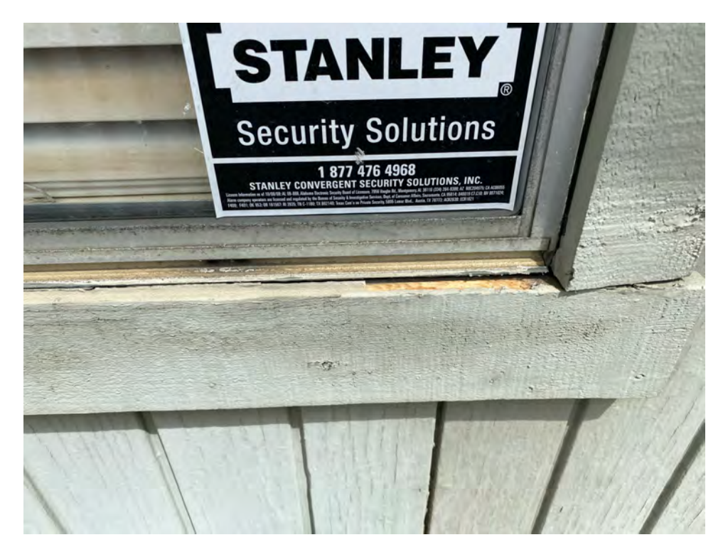
Photo 10- White Wood Fascia- 2515 Main St.- Exterior-Lead-Containing Paint (Good Condition)